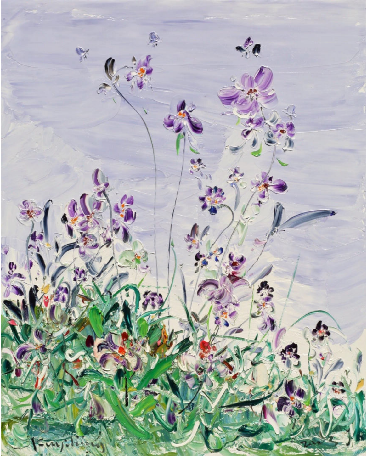
风亦舒 - Gentle breeze

80 x 100cm Oil and acrylic on canvas 2023