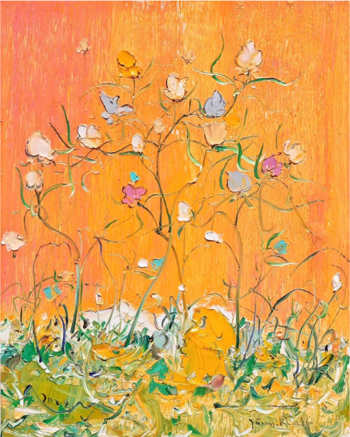
暖阳如斯 - Sunshine, just like you

80 x 100cm Oil and acrylic on canvas 2023