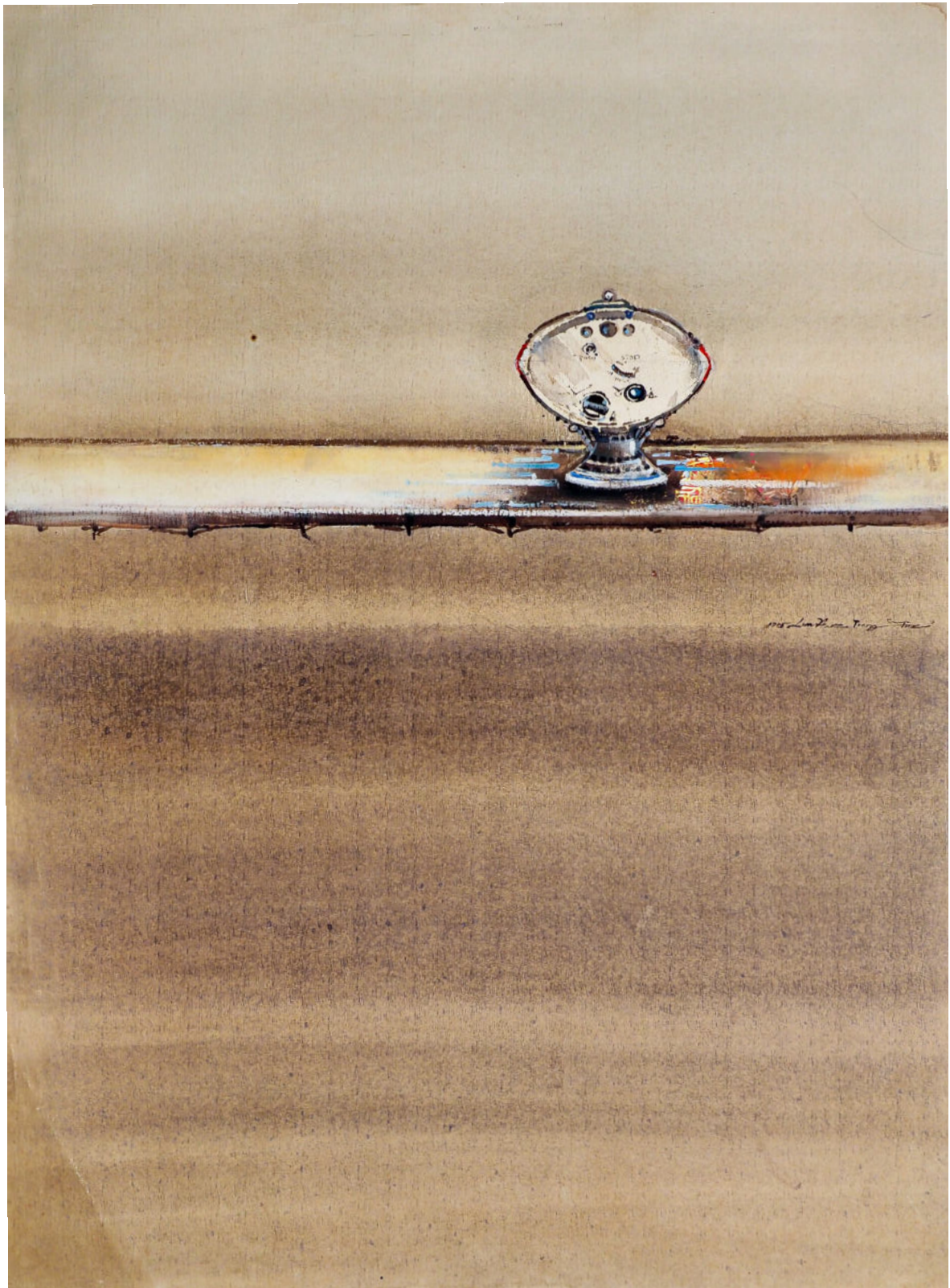
不再闹的遗憾 - Still life, Alarm clock