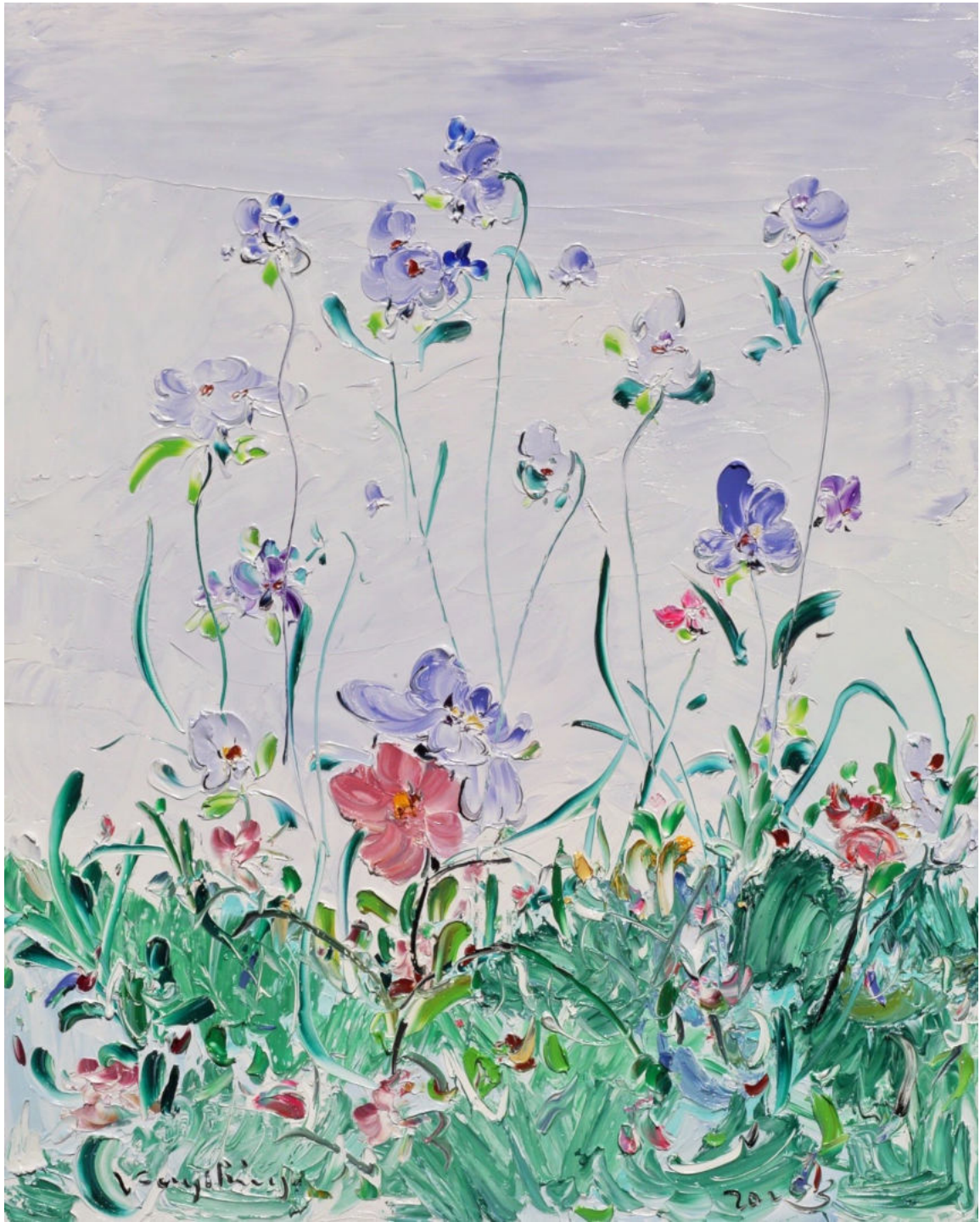
一颦一笑 - Every frown, every smile

80 x 100cm Oil and acrylic on canvas 2023