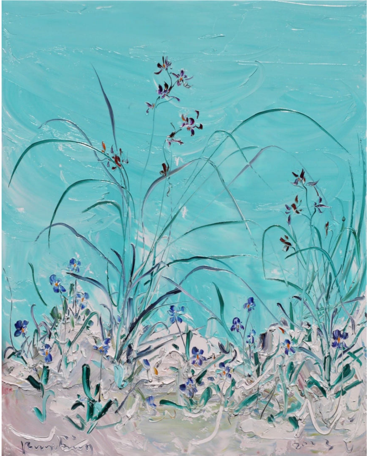
晨曦山风 - Mountain wind at dawn