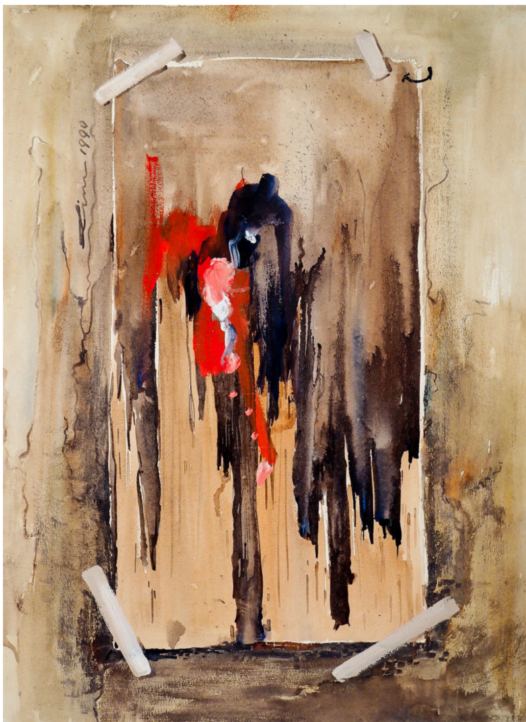
功成身退 - Wood