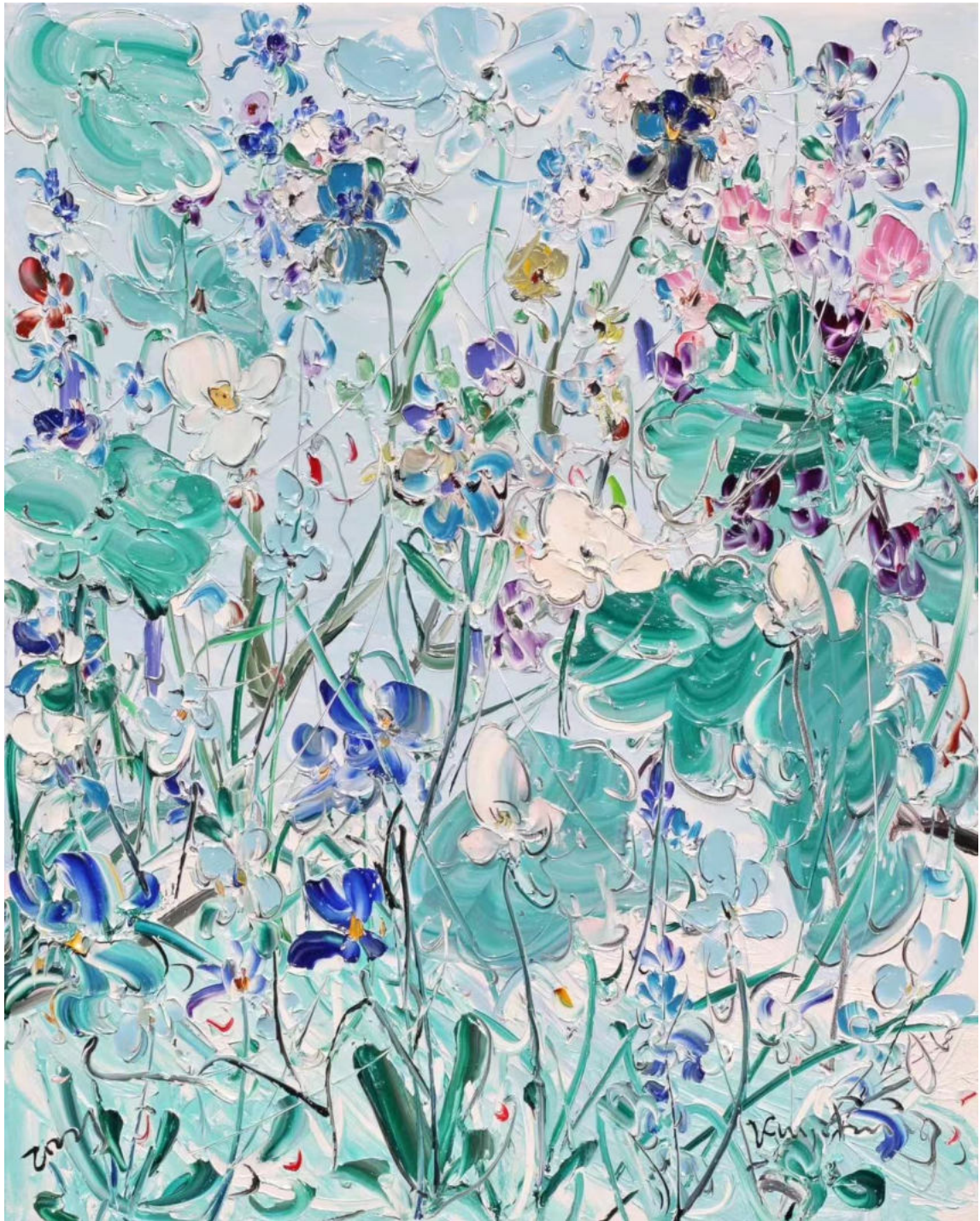
和风乍起 - A mild wind begins

80 x 100cm Oil and acrylic on canvas 2023