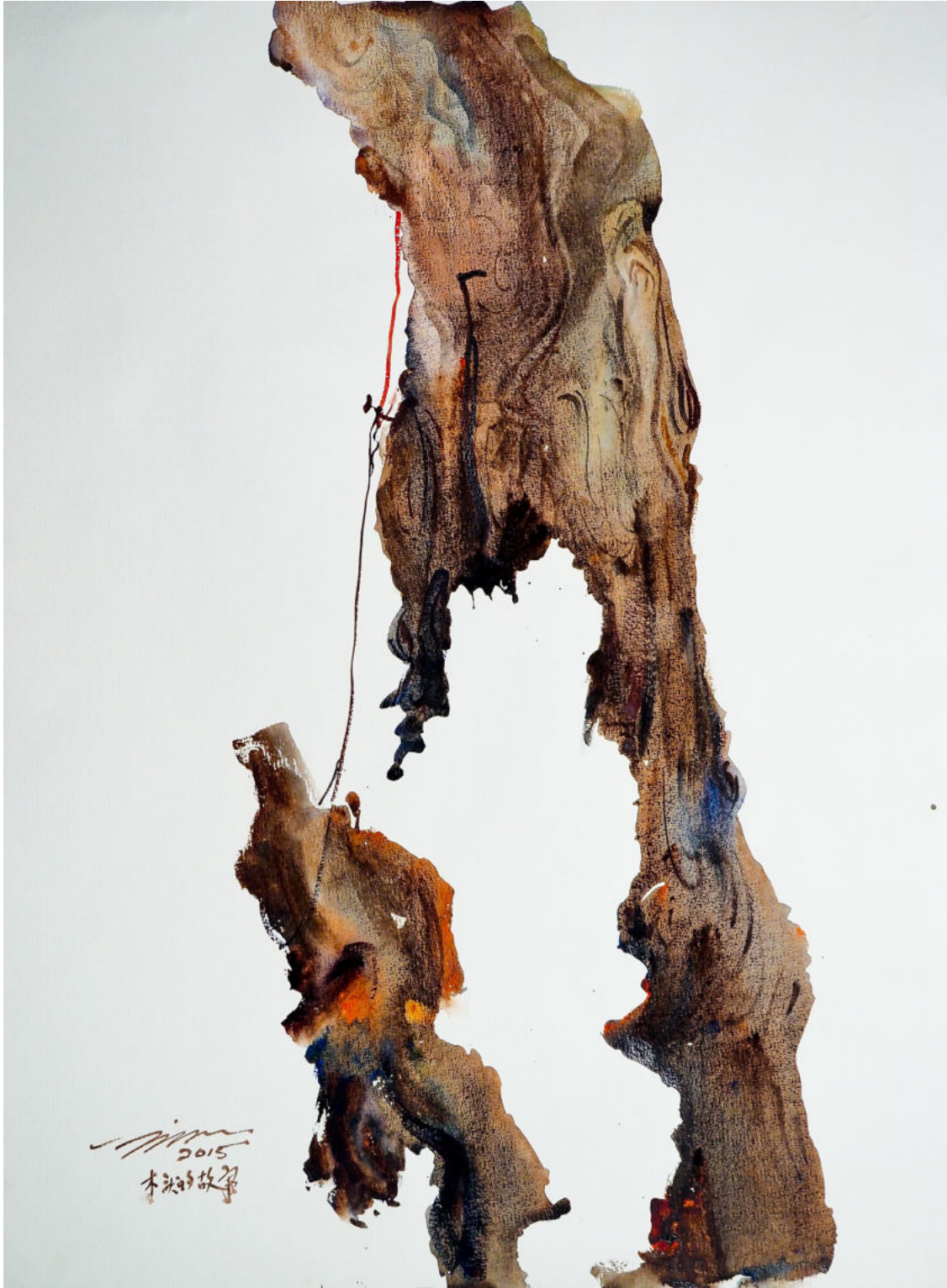
木头的故事 - Recent wood