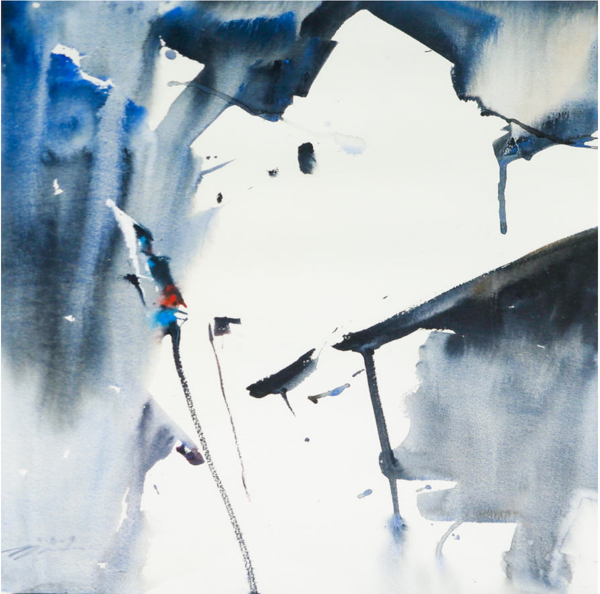
粉墙黛瓦 - White walls, Chinatown