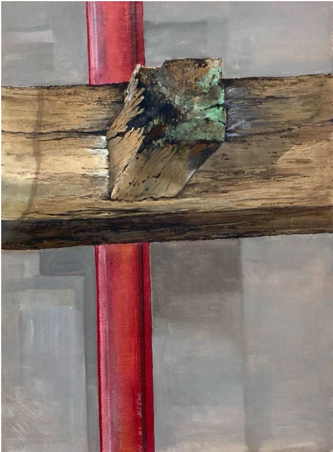
坚强 - Resilient